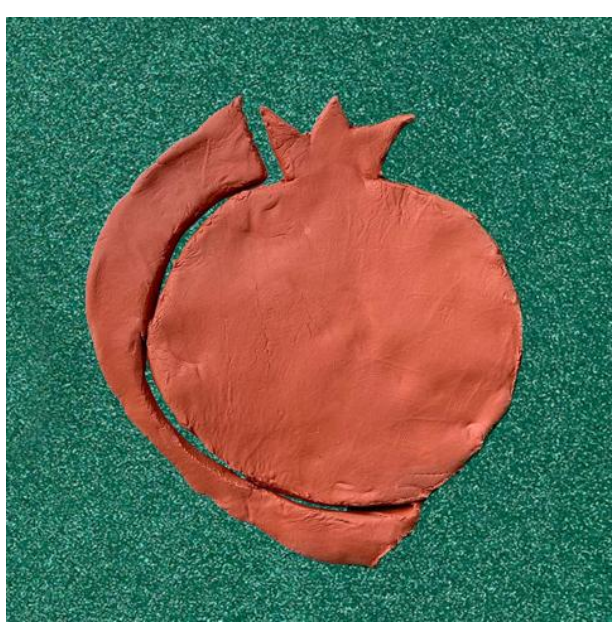
6. Carefully remove the extra clay that remains from your clay pomegranate.