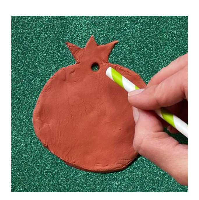
7. Don't forget to make a hole on your clay pomegranate in the spot shown on your pattern. That way you will be able to hang your pomegranate later by passing some ribbon or a string through the hole.