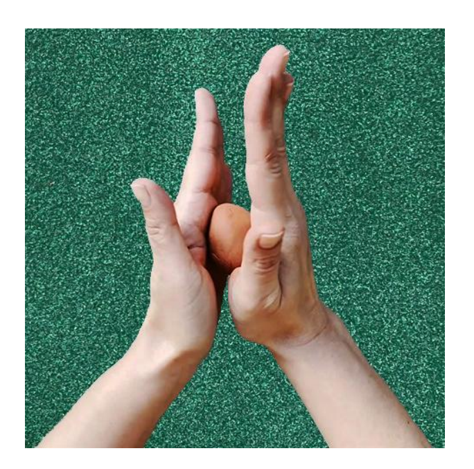
3. Take a piece of clay (or you can use salt 4. Carefully place the pomegranate dough) large enough to make a ball about the size of a ping pong ball. Press down to make a flat disc a little larger than the pomegranate you have cut out.