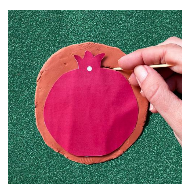
5. Take your toothpick and cut firmly around the pomegranate pattern.