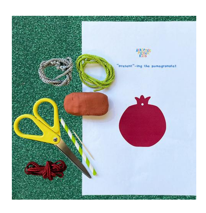
1. To make this lovely gift collect all your materials on a flat clear surface.