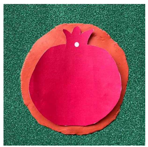
pattern on your flat clay so you can use it as a guide to cut out your pomegranate.